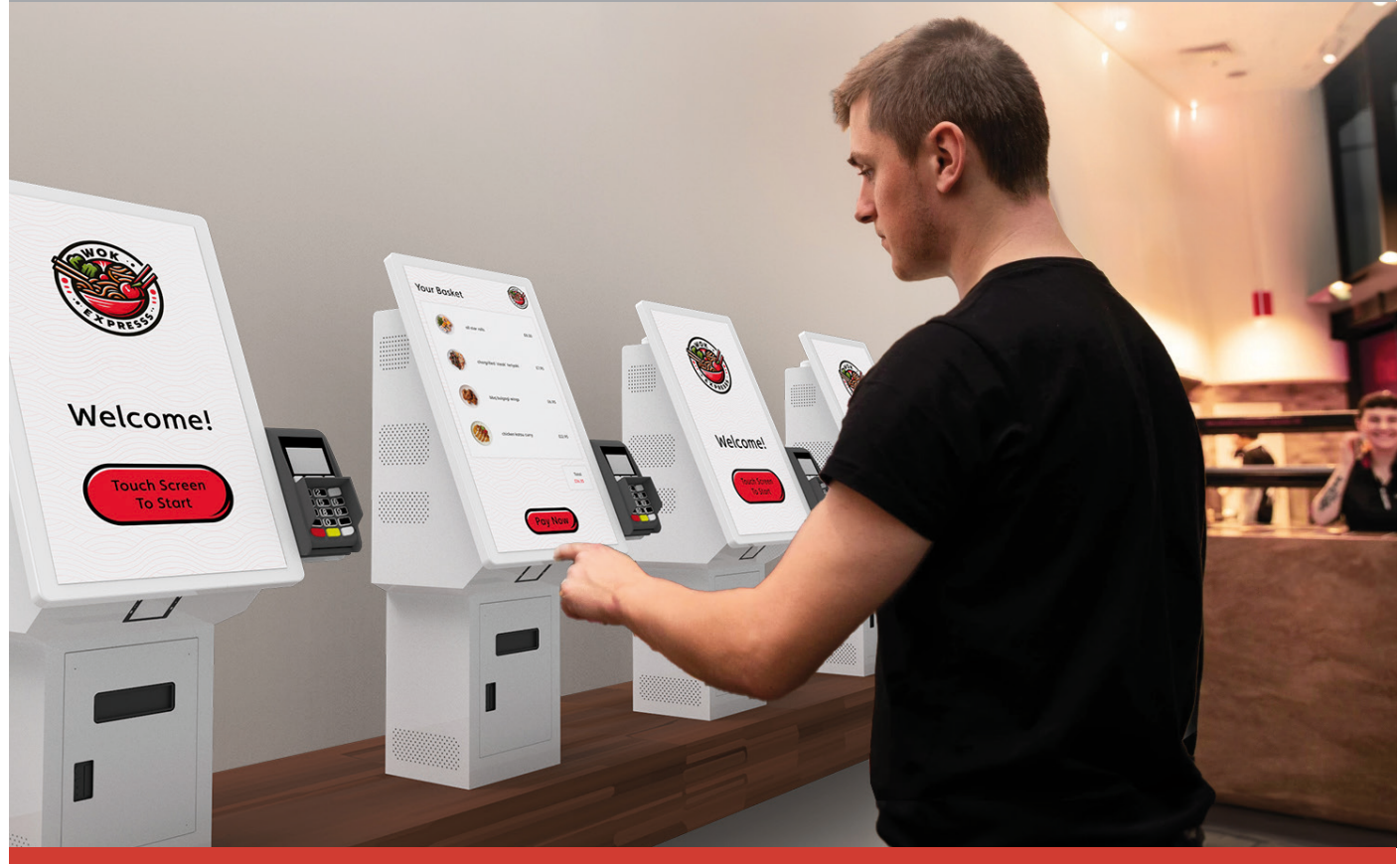
Self-ordering touch screen solution for quick service restaurants with integrated QR code scanner and receipt printer